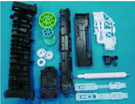
Injection Molded Plastic Examples