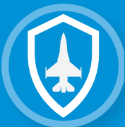
AVIATION DEFENSE SPACE